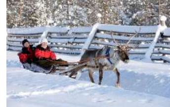
Reindeer's Farm 2.5km