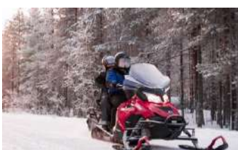
Snowmobile safari in Forest