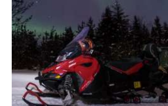
Aurora Snowmobile Safari