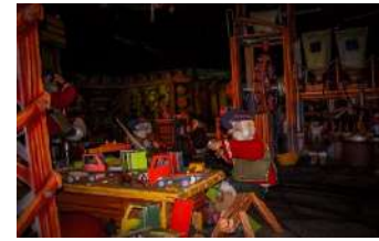
Santa Village and Santa Park