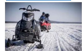
Easy Snowmobile Safari