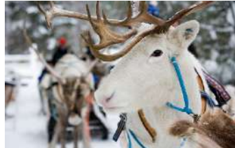
Snowmobile safari to reindeers