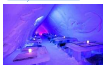
Arctic Hotel Visit with dinner