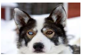
Snowmobile Safari to husky