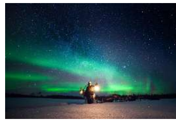
Aurora Hunting in reindeer's sleigh