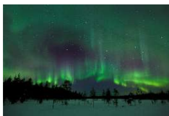
Private Aurora hunting by 4WD