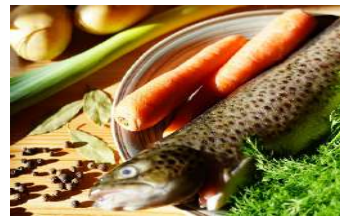
Lappish Cooking Class