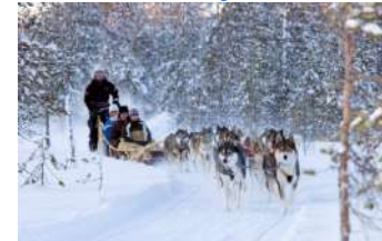
Husky Happy Trail Tour