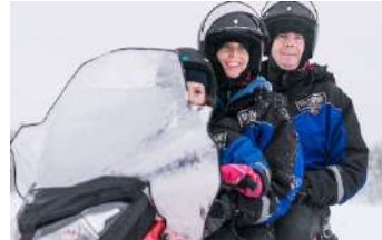
All-In-One Snowmobile Safari