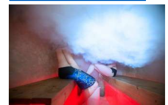
Snow Sauna in Arctic Hotel