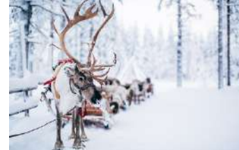
Reindeer's Farm Self-Driving