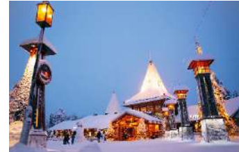
Santa Claus Village