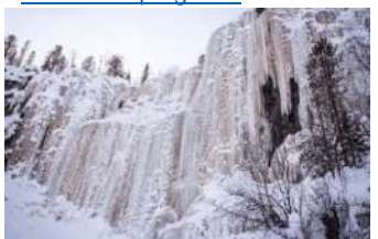
Korouoma Frozen Waterfalls