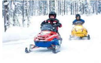
Snowmobile Family Safari