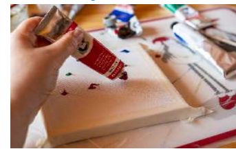
Workshop in Rovaniemi