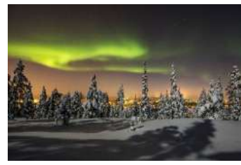
Photography Aurora Tour