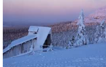
Amethyst Mine in Luosto