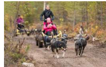
Husky Kennel Tour