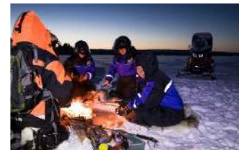
Full Day Snowmobile Safari