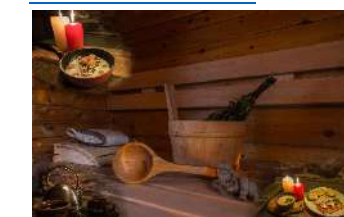
Lappish evening with dinner