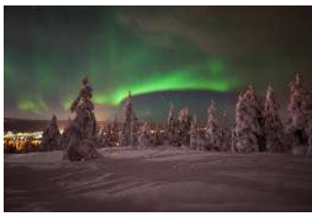
Aurora hunting by minibus