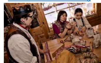
Secret of Reindeer's Antlers