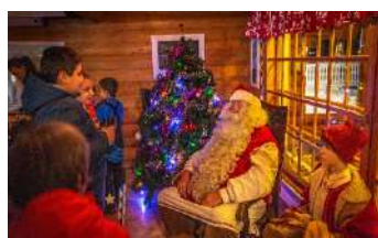
New Year Party